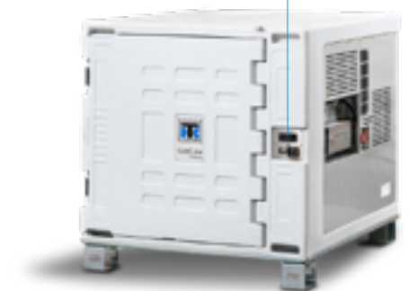
330L FLEX model