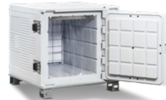
330L XF model

C = Cooling - F = Freezing - H = Heating - HF = Freezing & Heating - XF = Freezing -30°C Ambient temperature range: -10°C to +50°C