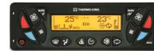
CANAIRE® drivers panel