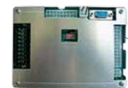
CANAIRE® Main module