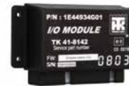
CANAIRE® I/O module